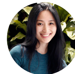
Zhubei Cofounder & Senior Partner