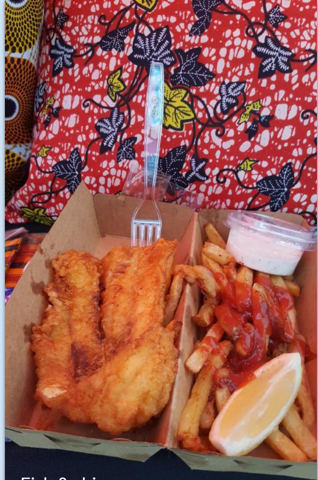
Fish & chips by Plan B

This event is open to the general public free of charge. It will be promoted by attending merchants and sponsors, on social media and in traditional media outlets in Beijing, plus press releases being sent out to all relevant international media.