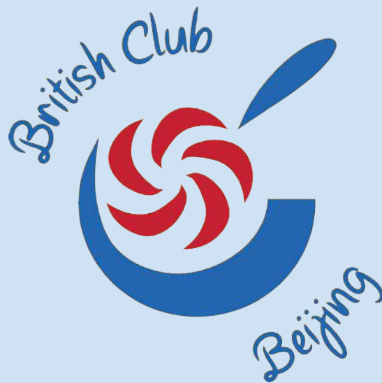
British Club of Beijing