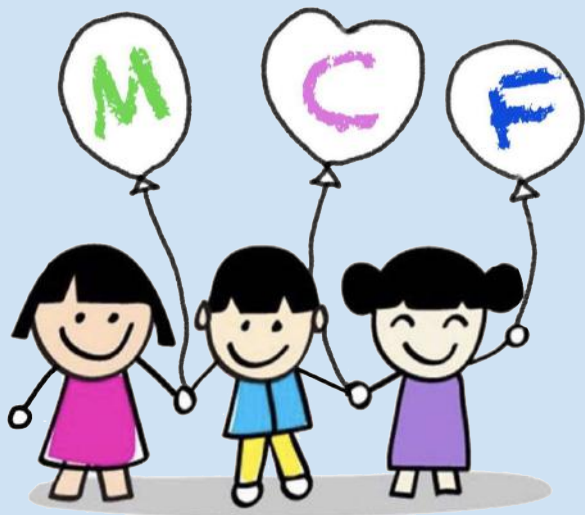
Migrant Children's Foundation

The Best of British Festival 2019 is proud to support the work of