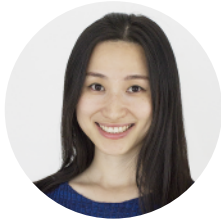
Zhubei Cofounder & Senior Partner