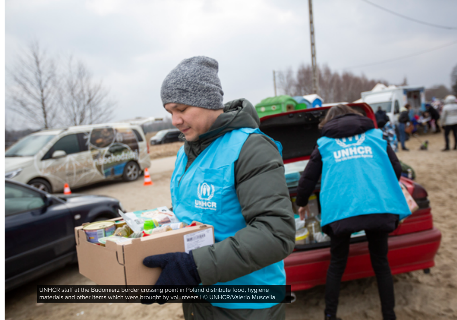
UNHCR staff at the Budomierz border crossing point in Poland distribute food, hygiene materials and other items which were brought by volunteers