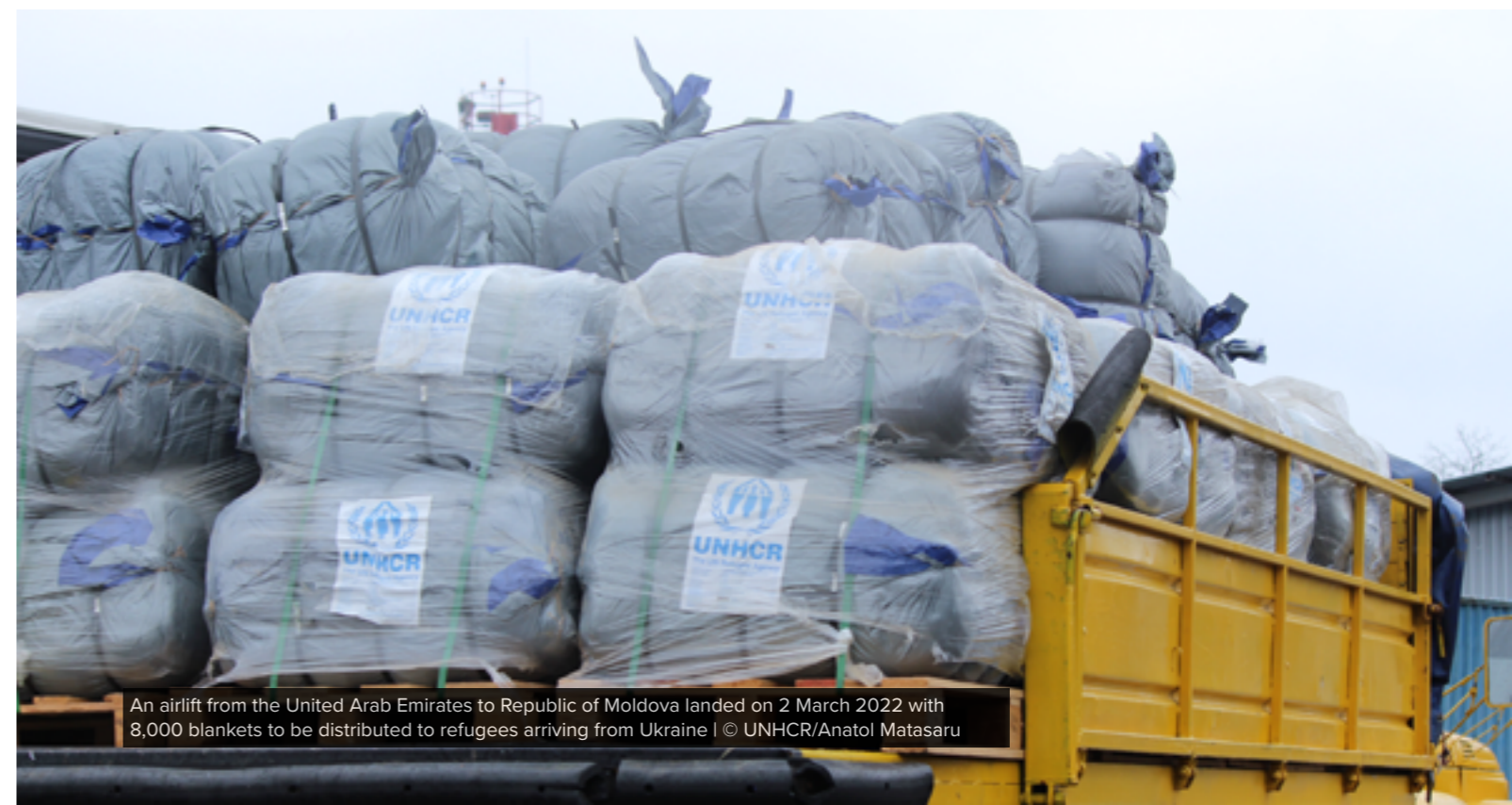
An airlift from the United Arab Emirates to Republic of Moldova landed on 2 March 2022 with 8,000 blankets to be distributed to refugees arriving from Ukraine

UNHCR is assessing the feasibility of distributing emergency cash through bank cards to new arrivals in various countries including Poland and the Republic of Moldova . Unrestricted cash programmes are also planned in other affected frontline countries. In the Republic of Moldova , UNHCR is working with partners to start small-scale emergency cash distributions in a temporary placement centre, focusing on specific cases initially while the mechanism for larger-scale assistance is set up. To this end, UNHCR is in discussions with financial service providers and relevant authorities on establishing an electronic cash delivery system. A Cash Working Group, co-chaired by the Ministry of Health, Labour and Social Protection and UNHCR, has been set up to help coordinate the delivery of cash assistance.