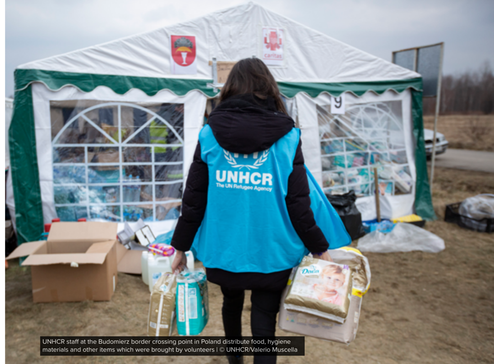
UNHCR staff at the Budomierz border crossing point in Poland distribute food, hygiene materials and other items which were brought by volunteers

The Global Focus situation page for the Ukraine Situation can be found here .