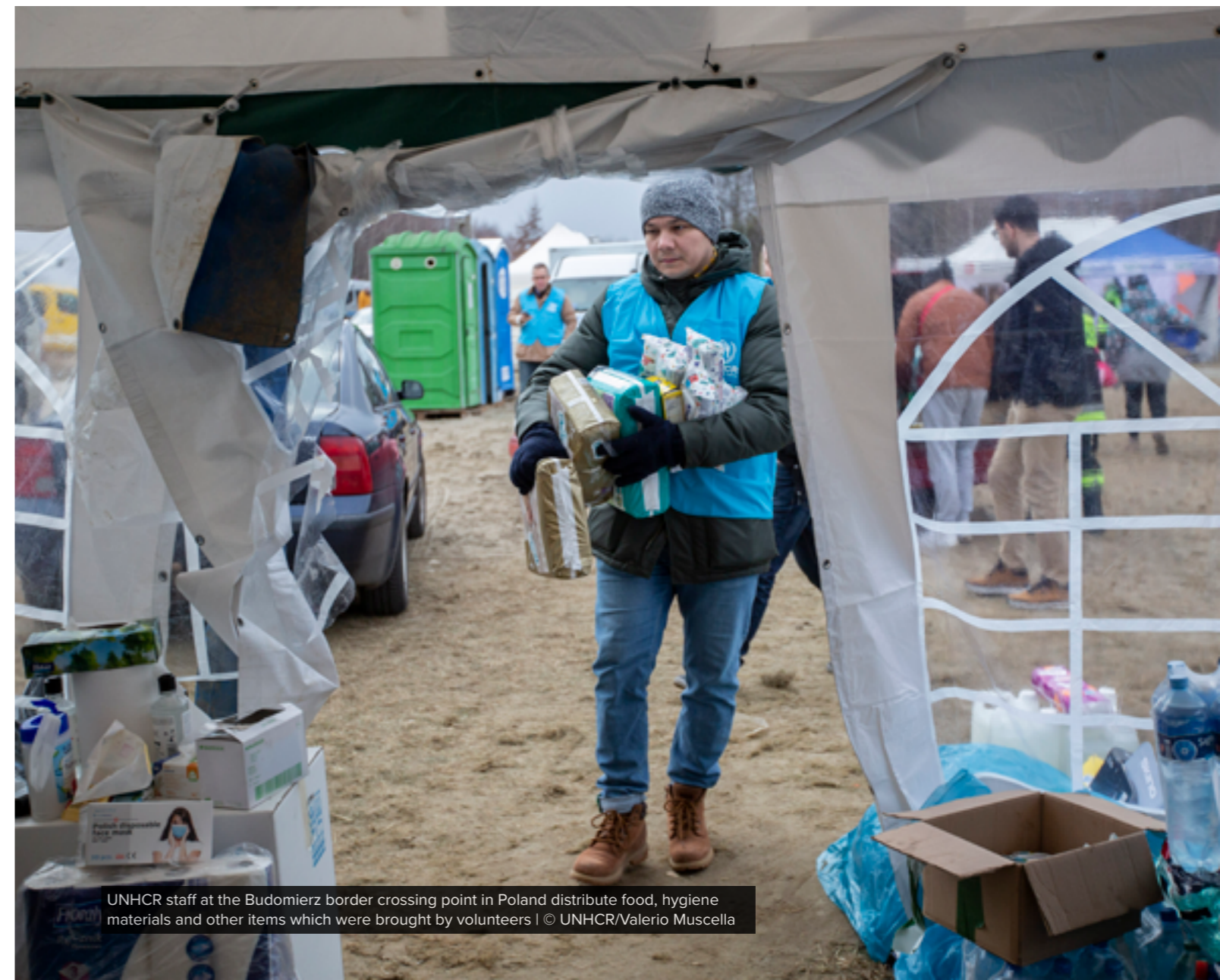
UNHCR staff at the Budomierz border crossing point in Poland distribute food, hygiene materials and other items which were brought by volunteers

In countries where it is required, UNHCR will provide emergency shelter and work with the authorities to establish temporary reception and/or transit facilities.