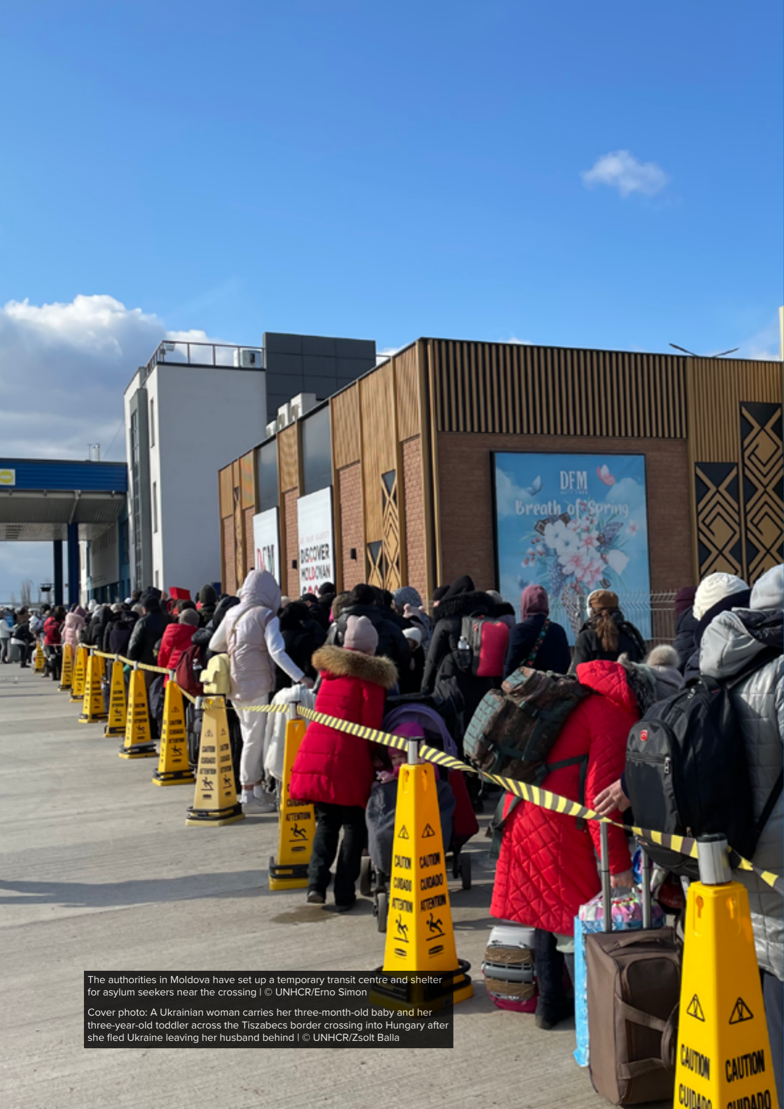
The authorities in Moldova have set up a temporary transit centre and shelter for asylum seekers near the crossing