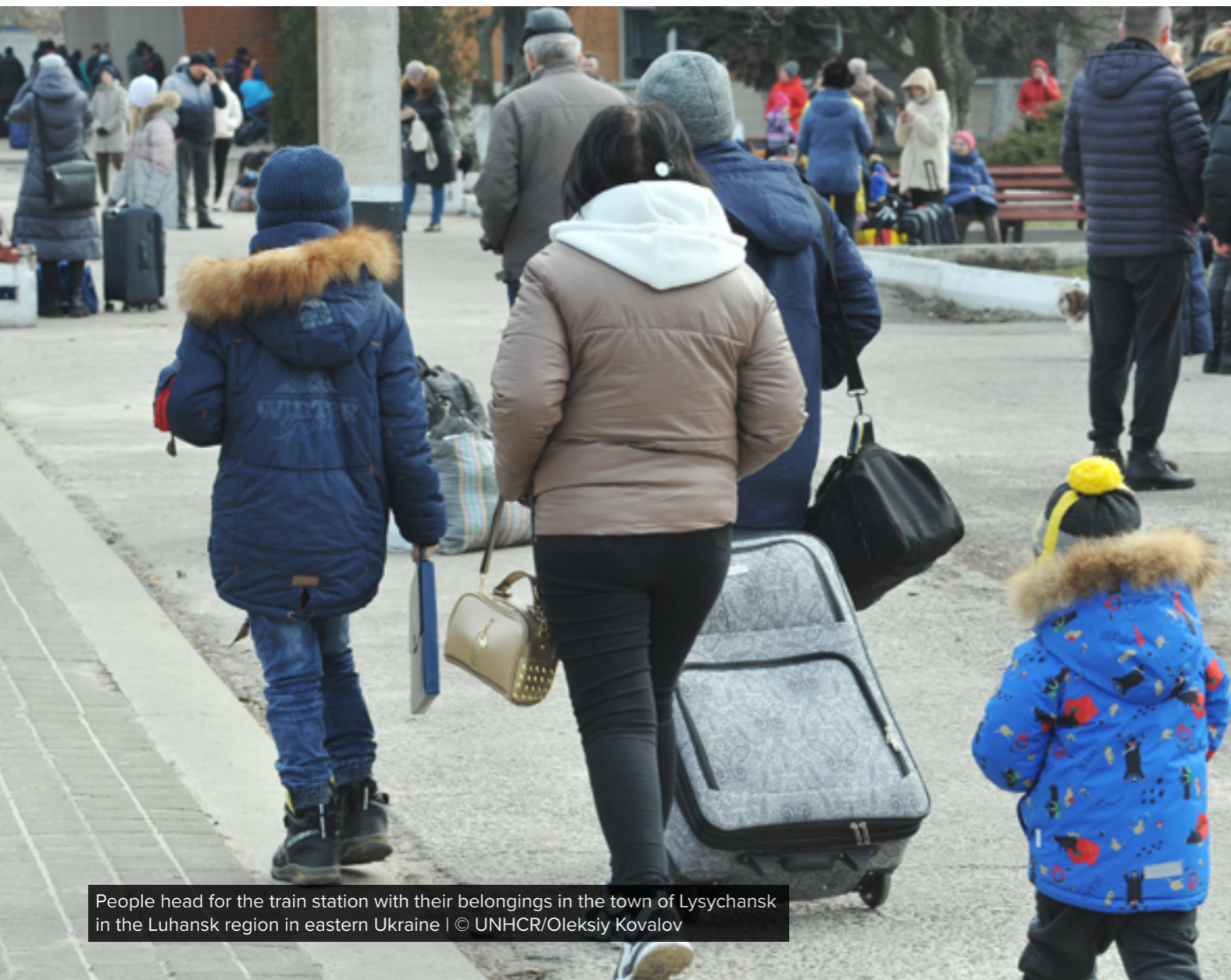
People head for the train station with their belongings in the town of Lysychansk in the Luhansk region in eastern Ukraine