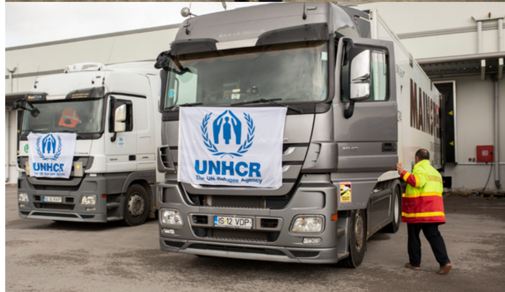
Trucks loaded with core relief items for the Ukraine emergency depart from UNHCR's warehouse in Athens heading for Moldova and Poland